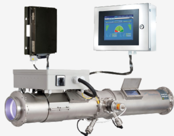
Ozone UV Destruction