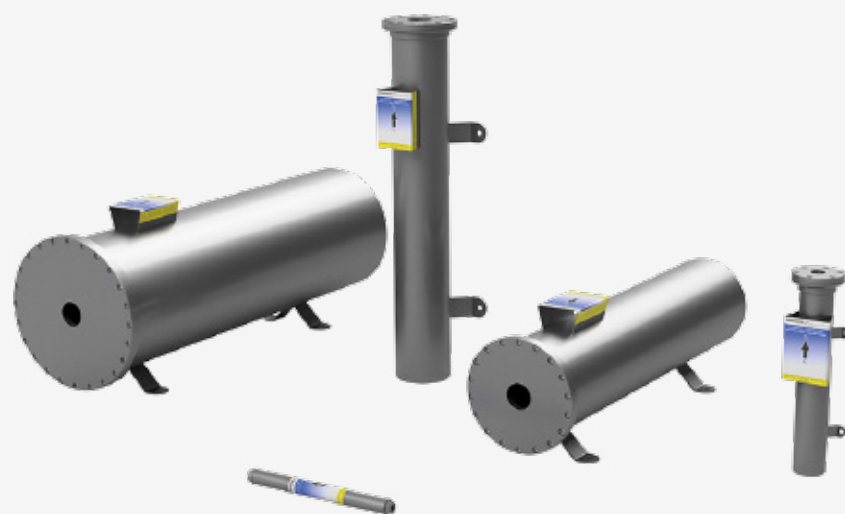
Storage Tank Ozone Destruction