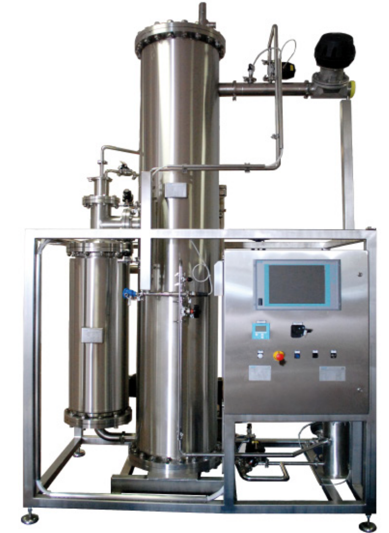
Pure Steam Generation