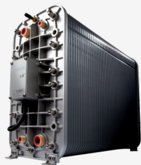
CDI/CEDI Ionpure Partner