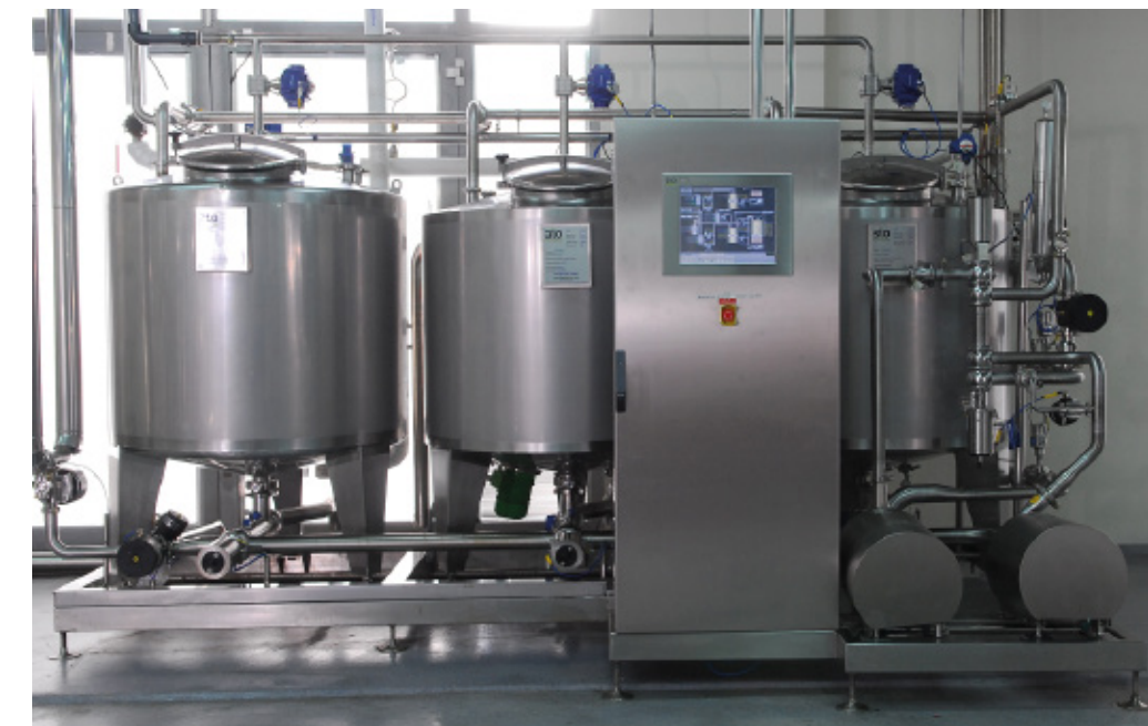
SIP/CIP, UF, TFF, Solids and Liquid Production