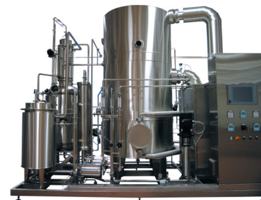
Vapor Compression for WFI