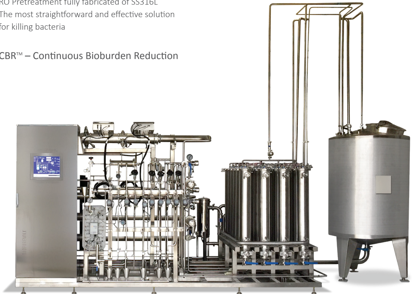
Complete System Supply

Treats the ESR water, by exposure to ultra violet radiation which decomposes the free chlorine and destruction of micro-organisms.